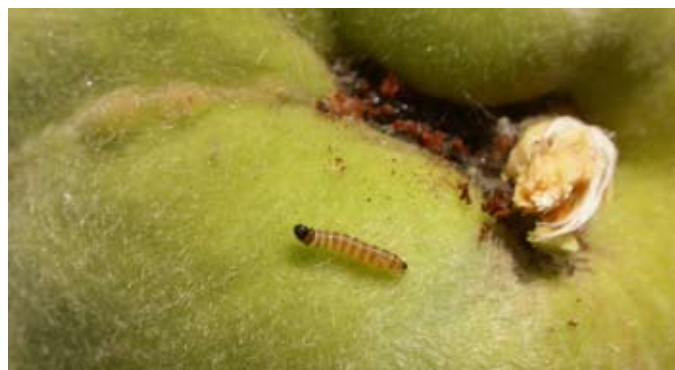
Fig. 1. Young peach twig borer larva on peach