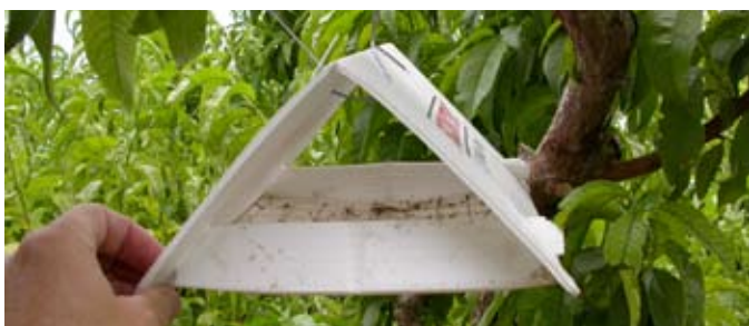
Fig. 7. Plastic delta trap with pheromone lure inside

Large delta (Fig. 7) or wing style pheromone traps are available for purchase to monitor adult activity. Sex pheromone lures are sold separately and when placed inside the traps dispense the female sex pheromone that is attractive to males only. A sticky surface inside the trap collects the moths (Fig. 4). Lures are available in a 30-day or 60-day formulation.