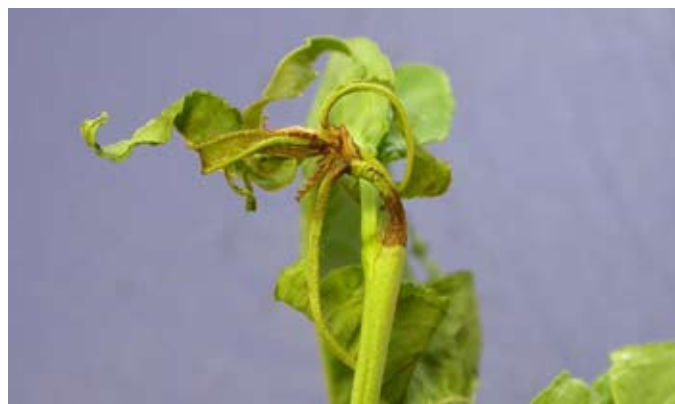
Fig. 2 Shoot strike damage caused by overwintered larvae

Peach twig borer ( Anarsia lineatella ) is found worldwide wherever stone fruits are grown. In Utah, it is a significant pest on peach, nectarine, and apricot. There are typically three generations of peach twig borer in northern Utah (May-June, July, and August-September) and four or more in southern Utah. Young larvae (Fig. 1) that have overwintered emerge from protected shelters on limbs and twigs during bloom to petal-fall and burrow into developing shoots (Fig. 2). When populations are high, spring larval feeding can cause substantial damage to trees. The first adults are usually detected during April in southern Utah and May in northern Utah. Economic yield loss occurs during the summer when larvae of subsequent generations attack the fruit (Fig. 3). Insecticides are currently the most effective control tactic. Lower toxicity insecticides such as microbial products ( Bacillus thuringiensis and spinosad) and insect growth regulators (methoxyfenozide, diflubenzuron, and others) can provide excellent control when timed with early larval feeding and egg hatch.