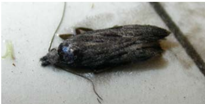
Fig. 4. Adult male peach twig borer moth