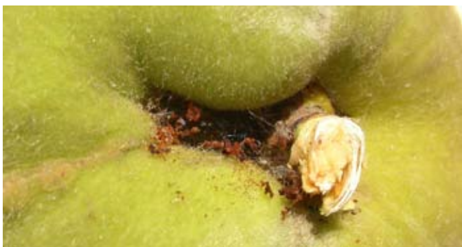
Fig. 3. Damage to fruit caused by peach twig borer larvae