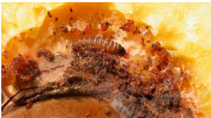
Fig. 6. Interior peach injury caused by borer feeding